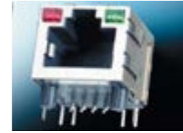
单端口 - 弯角式 · RJ45