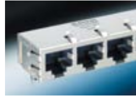
多端口 - 弯角式成组型 ( 带有集成磁性元件 )