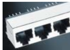
多端口 - 垂直式成组型 · RJ45