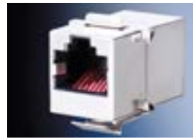
模块化适配器 - RJ11和RJ45