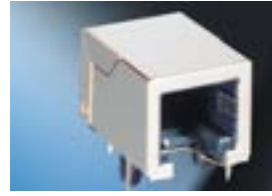
单端口 - 弯角式 · RJ11