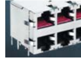
多端口 - 弯角堆叠型 · RJ45