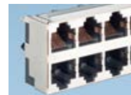
多端口 - 垂直堆叠型 · RJ45