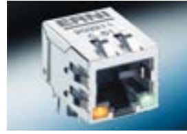
单端口 - 弯角式 (带有集成磁性元件)