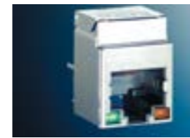
单端口 - 垂直式 (带有集成磁性元件)