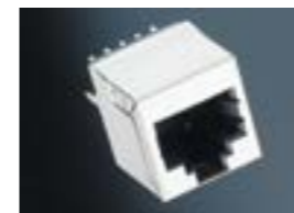
单端口 - 垂直式 · RJ45