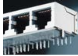
多端口 - 弯角式成组型 · RJ45